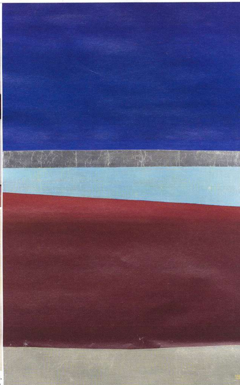
Anna-Eva Bergman, N°50-1969, Arctic Night II [ N°50-1969, Nuit arctique II ].