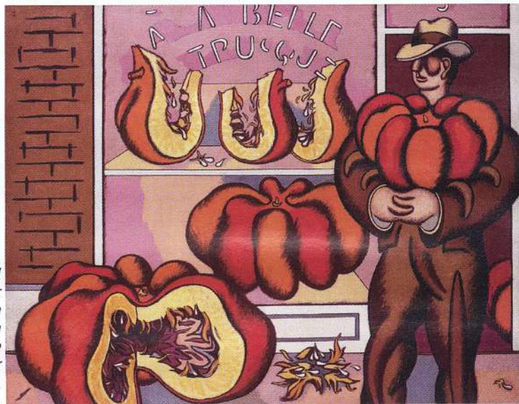
Jean Hélon, The Beautiful Etruscan (or the Pumpkin Carrier) [ La Belle Étrusque (ou le porteur de citrouille) ].