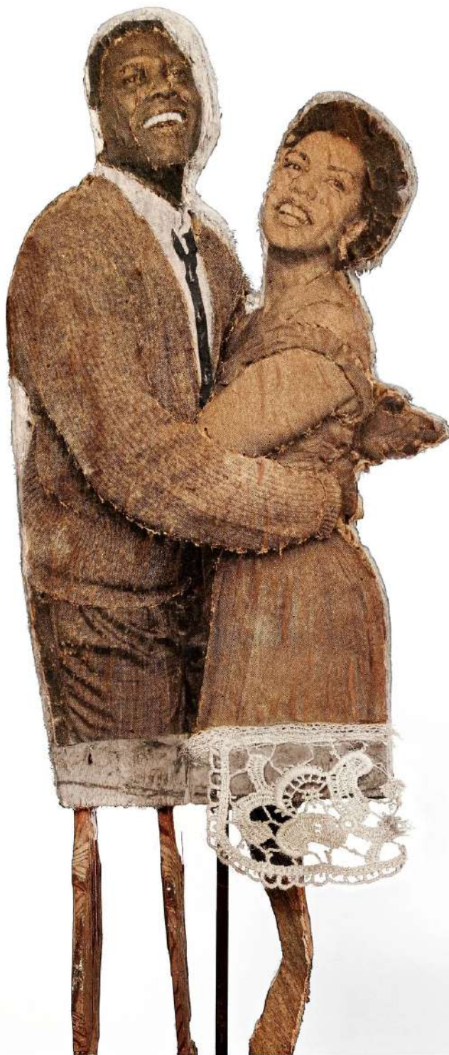
In an untitled work, Steve Ashby used cutout images of an embracing couple, glued them to matching pieces of wood and mounted them on sticks. Steve Ashby

Steve Ashby (1904-1980) gave cutout images of faces and figures solidity by gluing them to wood and mounting them on sticks, as with a smiling, embracing couple. Elsewhere the more natural forms prevail. In an especially impressive piece, a woman has curving branches for arms, and seems to erupt out of a large burl, like a goddess.