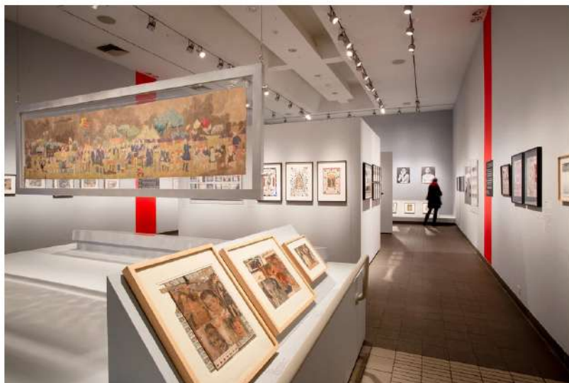
Installation view of “Photo Brut: Collection Bruno Decharme & Compagnie” at the American Folk Art Museum. Forefront, Henry Darger’s panoramic view of the androgynous Vivian Girls.

The works here are drawn primarily from the extensive collection of Bruno Decharme, a French film director, whose non-photographic holdings were shown at this museum in 2001. It was organized by Decharme and Valérie Rousseau, senior curator at the Folk Art Museum, and gives further prominence to the useful phrase Photo Brut — rawness is something of a byword in the work here — and seems bound for wider usage.