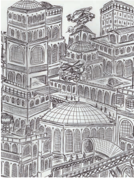
Damián Valdés Dilla Untitled (detail) , 2014 Ballpoint pen and graphite on paper 11.75 x 36.8 in. (29.9 x 93.7 cm)