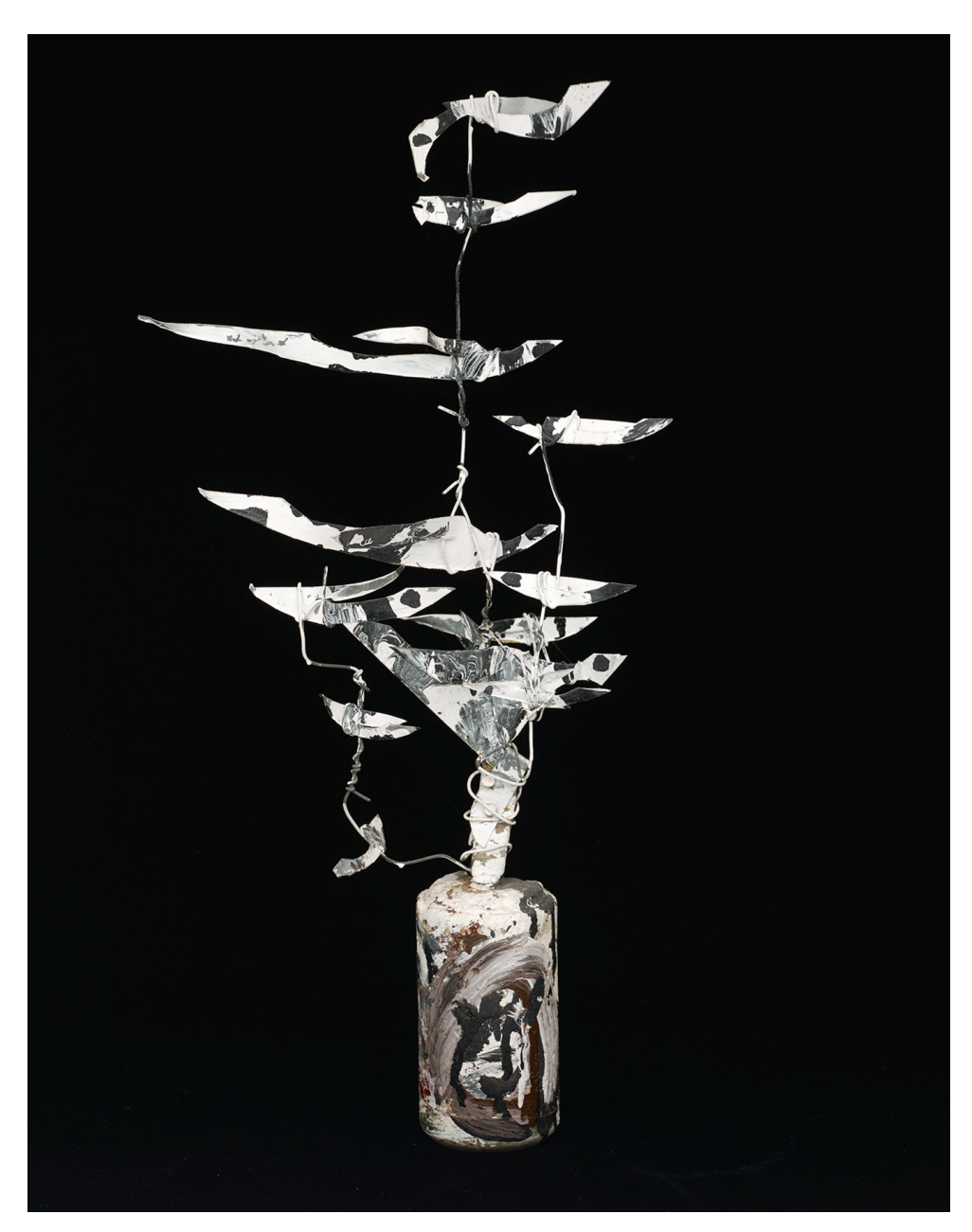
Thornton Dial Birds Will Fly, 1994 Cut sheet metal, wire, beer can, concrete and enamel paint 19 \times 9 \times 6 inches