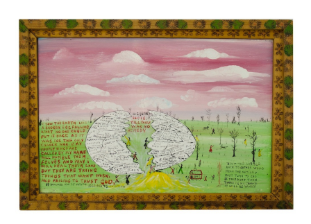
Howard Finster I Saw the Earth Like a Broken Egg, 1978 Tractor enamel on metal in cypress frame 12.25 x 18 inches