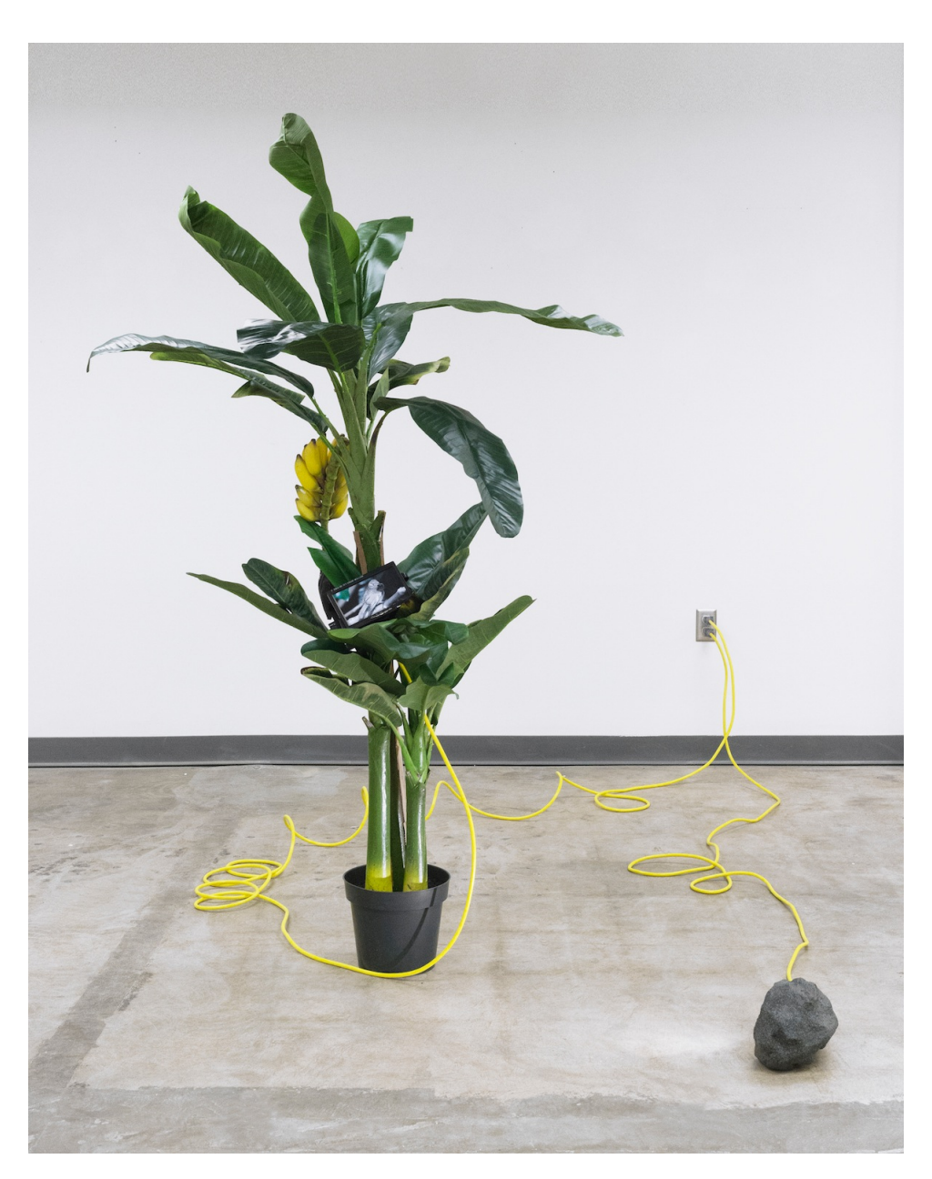
Justin Hodges Resting Bird, 2014 Artificial banana tree, video installation 47 x 36 x 33 inches