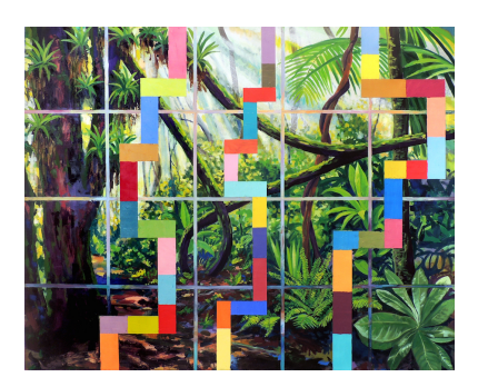
Robert Tharsing Paradise Interrupted, 2015 Acrylic and oil on canvas 48 x 60 inches

95 rivington street new york, ny 10002 +1 917 525 5939 contactnyc@christianberst.com